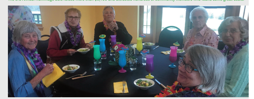
The Spring Fling in May drew 100 attendees who enjoyed a Hawaiian lunch and live hula dancing.