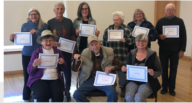
Graduates of the Fall/Winter 2019 Matter of Balance Class

highlights this year were two sessions of A Matter of Balance classes thanks to a generous grant from the Rocky Mountain Health Foundation. Close to 30 seniors benefitted from the class that taught them how to recognize fall dangers and how to minimize falls using positive thinking and proactive strategies. Our ongoing partnership with Northwest Colorado Health for weekly exercise classes continues to be very popular. A yoga class is being planned and will be offered this winter, thanks to a grant from the United Methodist Women.